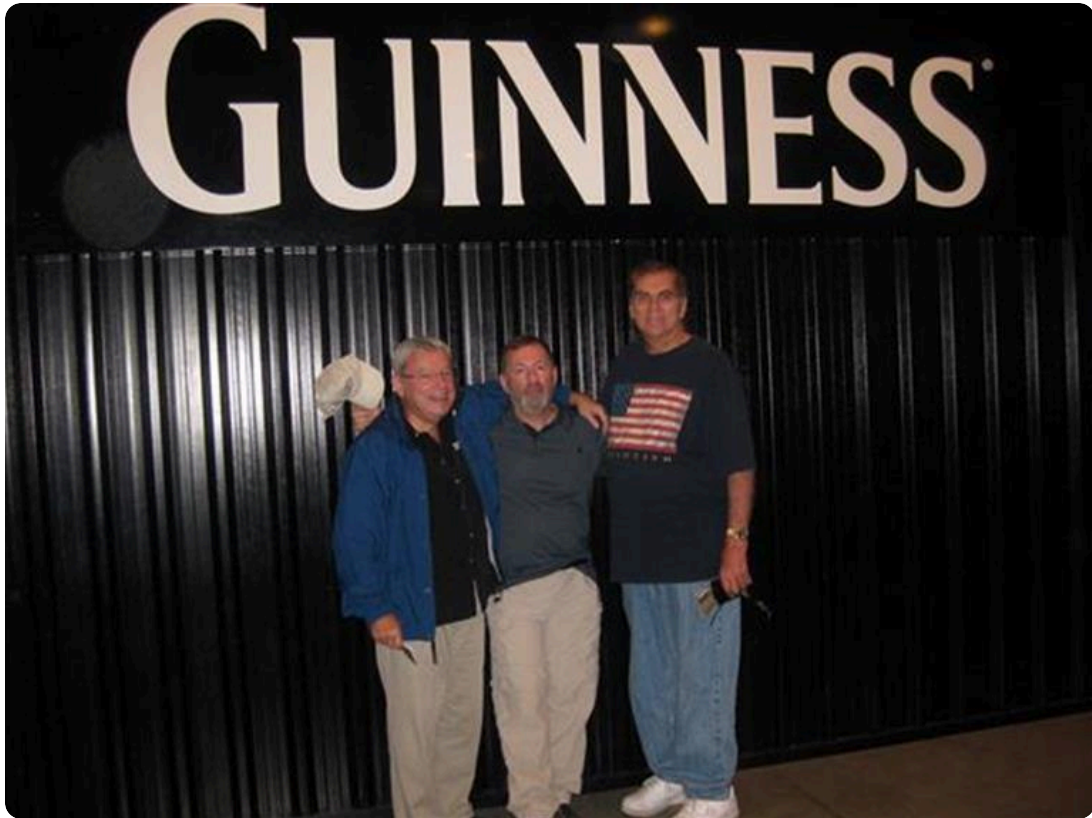
Trip to Ireland