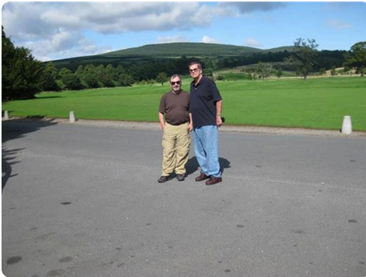
Trip to Ireland