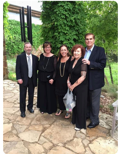
Wedding in Austin